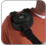
Model 3313 PHYSIO-STIM