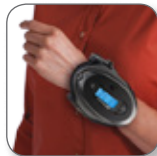
Model 3202 PHYSIO-STIM