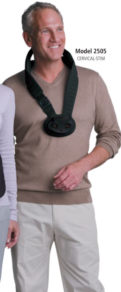
Model 2505 CERVICAL-STIM