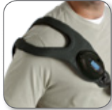
Model 3314 PHYSIO-STIM