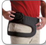
Model 3315 PHYSIO-STIM