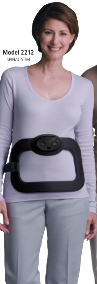
Model 2212 SPINAL-STIM