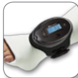
Model 3303 PHYSIO-STIM